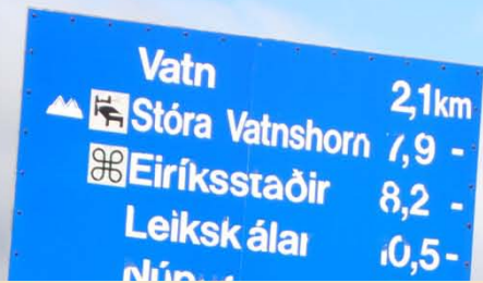
Home of Eirik the Red and Leif the lucky