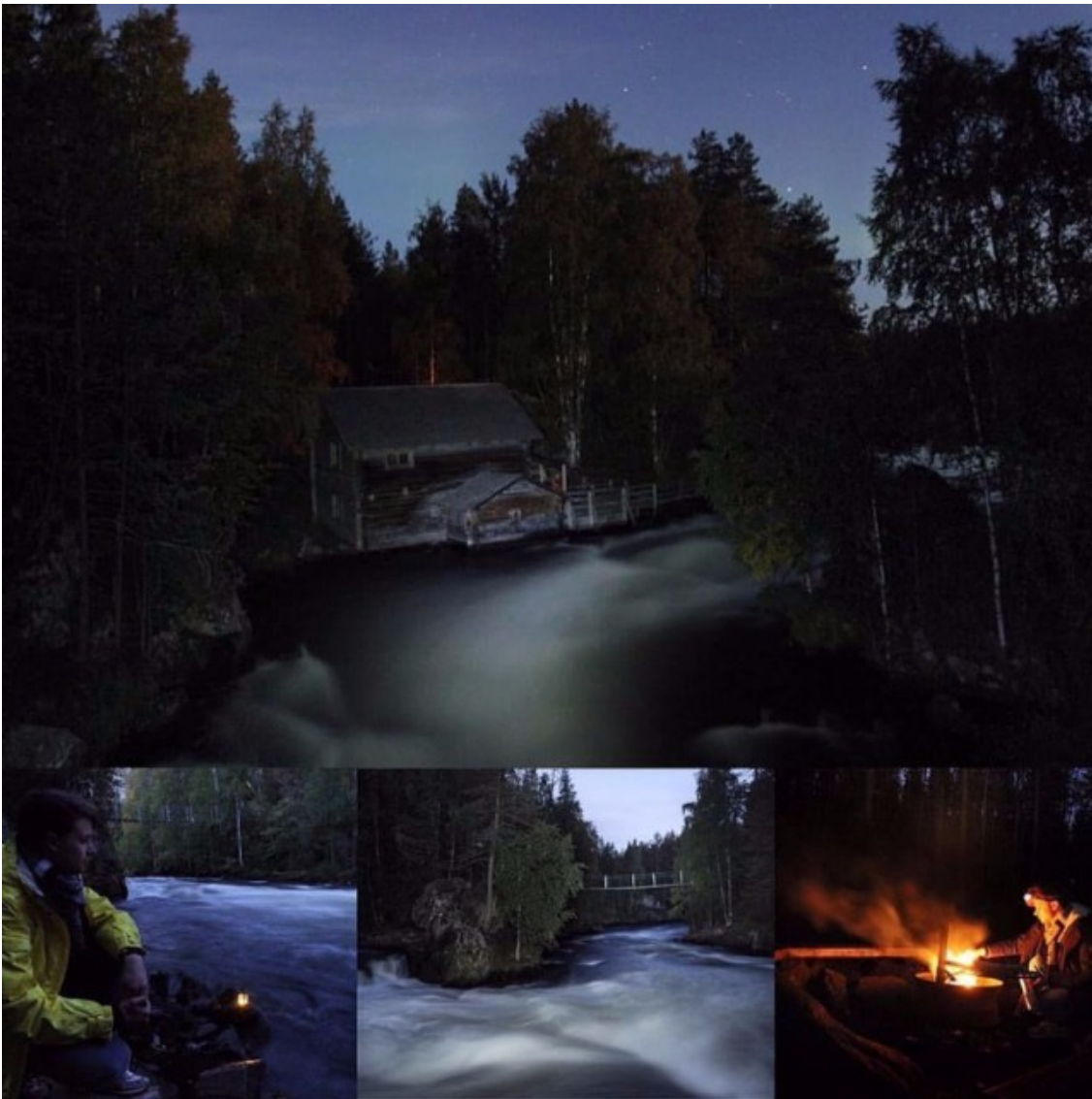
Ruka Adventures, Oulanka National Park